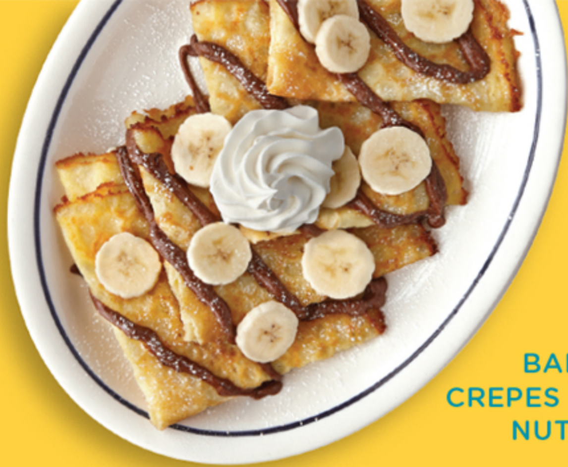
BANANA CREPES WITH NUTELLA®