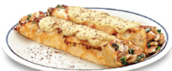
Chicken Florentine Crepes Two crepes filled with grilled chicken breast, fresh spinach, mushrooms, onions & Swiss. Topped with hollandaise. 9.99