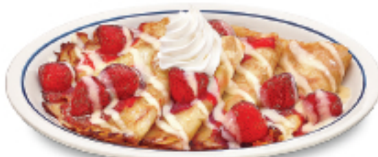
Strawberries & Cream Crepes Four delicate crepes topped with glazed strawberries & vanilla cream drizzle. 7.59