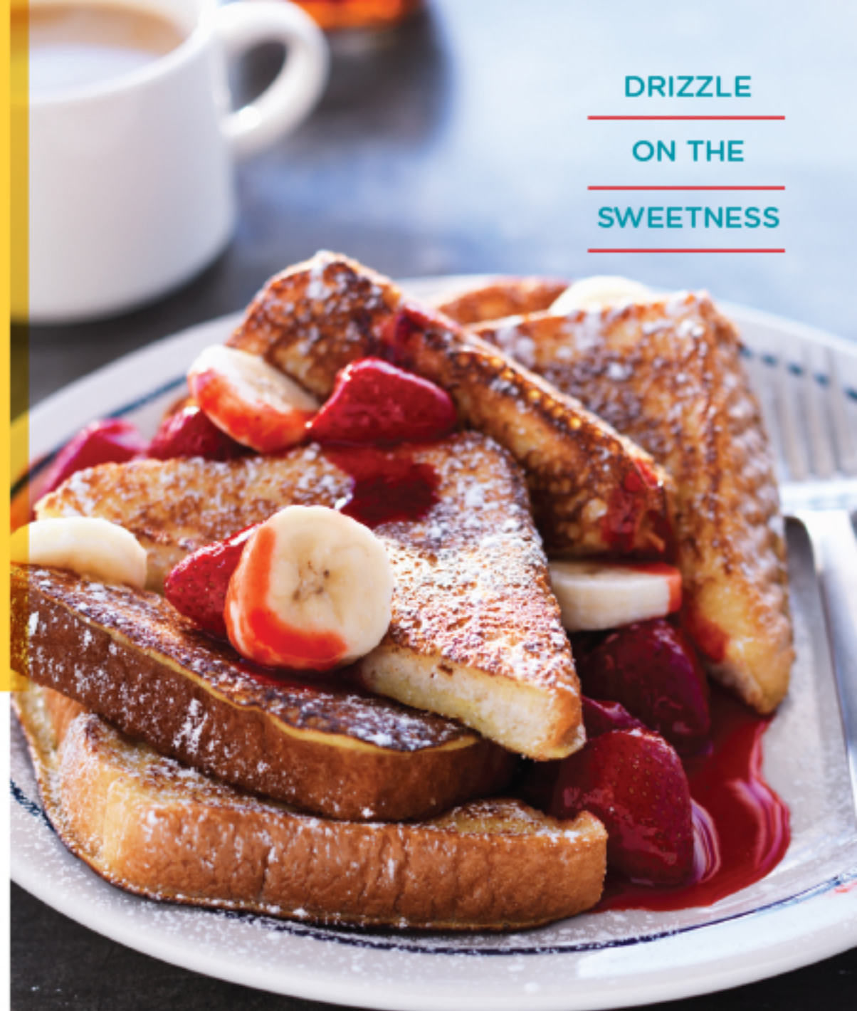
Strawberry Banana French Toast