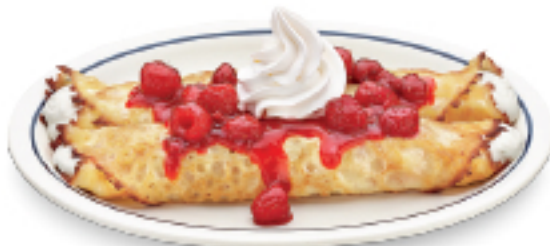
Sweet Cream Cheese Crepes Two crepes with sweet cream cheese filling. Topped with choice of raspberry topping or peach topping. 7.59