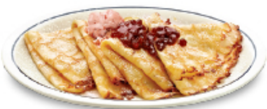
Swedish Crepes Four delicate crepes topped with sweet-tart lingonberries & lingonberry butter. 7.39