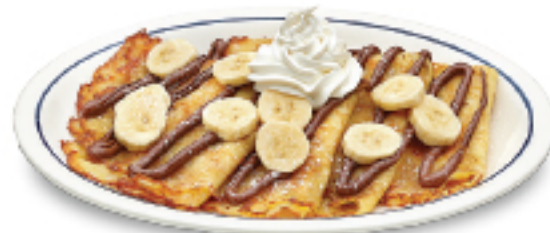
Banana Crepes with Nutella® Four delicate crepes topped with Nutella® The Original Hazelnut Spread® & freshly sliced bananas. 7.59