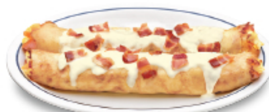
Classic Breakfast Crepes Two crepes stuffed with scrambled eggs, bacon, ham & White Cheddar. Topped with a creamy White Cheddar sauce. 8.99